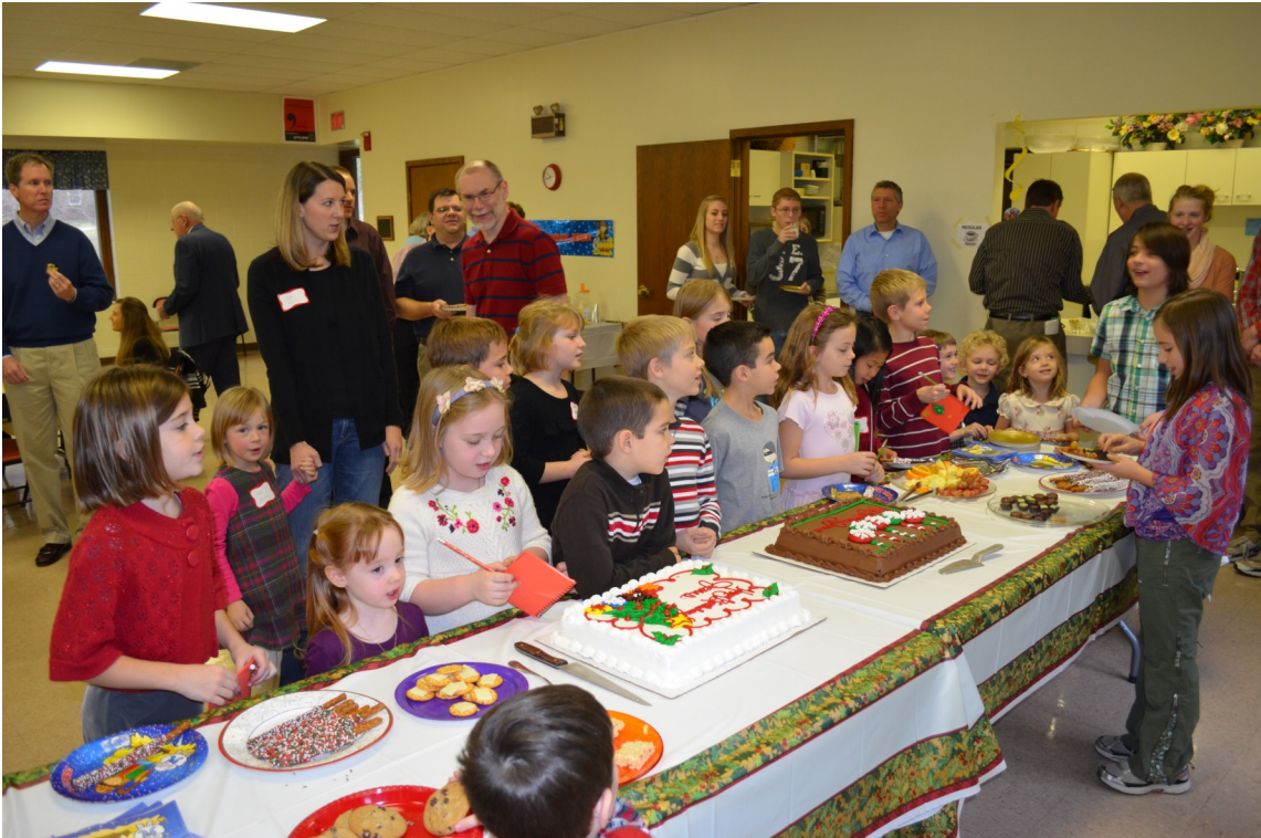
Birthday Party for Jesus Coffee on December 16th, 2012