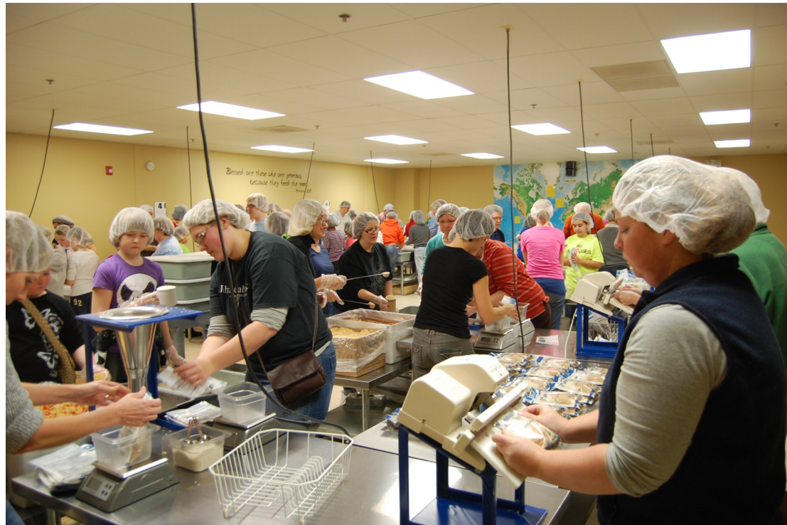
Workers at Feed My Starving Children January 2012

The 5 th annual church trip to Feed My Starving children will be on Monday, January 21st, 2013. We will meet at the church to carpool at 1:45p, and arrive around our scheduled start time of 2:30. We will stay from 2:30-4:30 and then carpool back. This year, I am taking phone calls to reserve names. I have reserved 50 spots. My hope is that we are able to fill all fifty spots. Just a reminder, that we need adults AND children, but the children MUST be 3 rd grade or older to come. No open-toed shoes please! You may either call me at 1-(630)-665-7577 to reserve names, or put the names on the board that will be in the Narthex starting in January. If I get your names over the phone, I will put them on the board for you. Save the date! -Alex Johnson