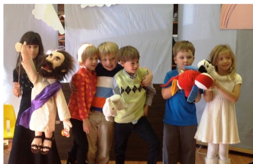
Pictured: Puppet workshop and trunk or treat