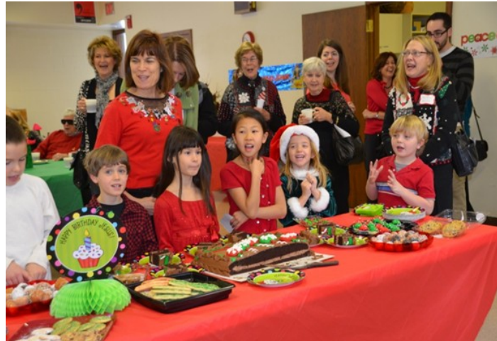
Birthday Party for Jesus