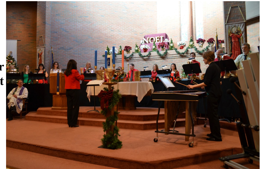
Bell Choir December 1st