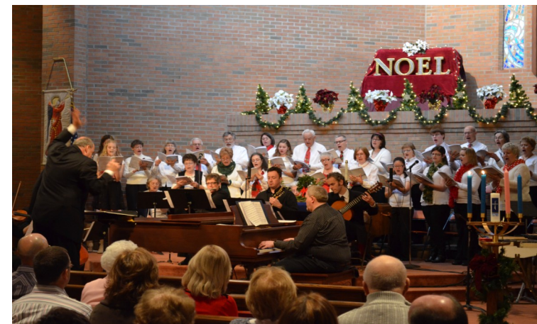
Choir Cantata December 8th