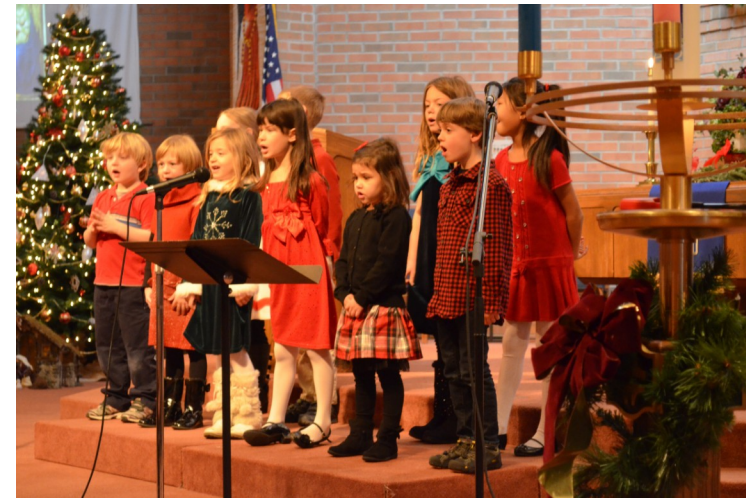
Children's Musical at St. Matthew December 15th