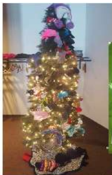
Children's Ministry Christmas Activities